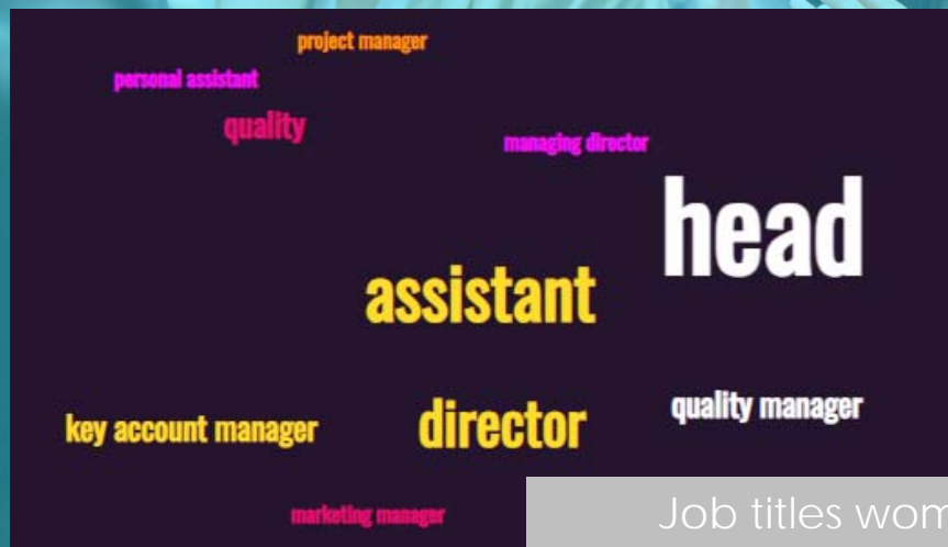
Job titles women

Women in FVL*