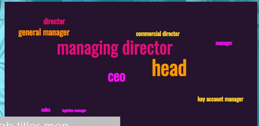
Job titles men