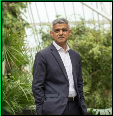
London Mayor Sadiq Khan, elected Chair of C40

C40 Cities is a network of nearly 100 world-leading cities collaborating to deliver the urgent action needed to confront the climate crisis.