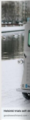
Helsinki trials self-driving robot for last-mile delivery goodnewsfinland.com ·