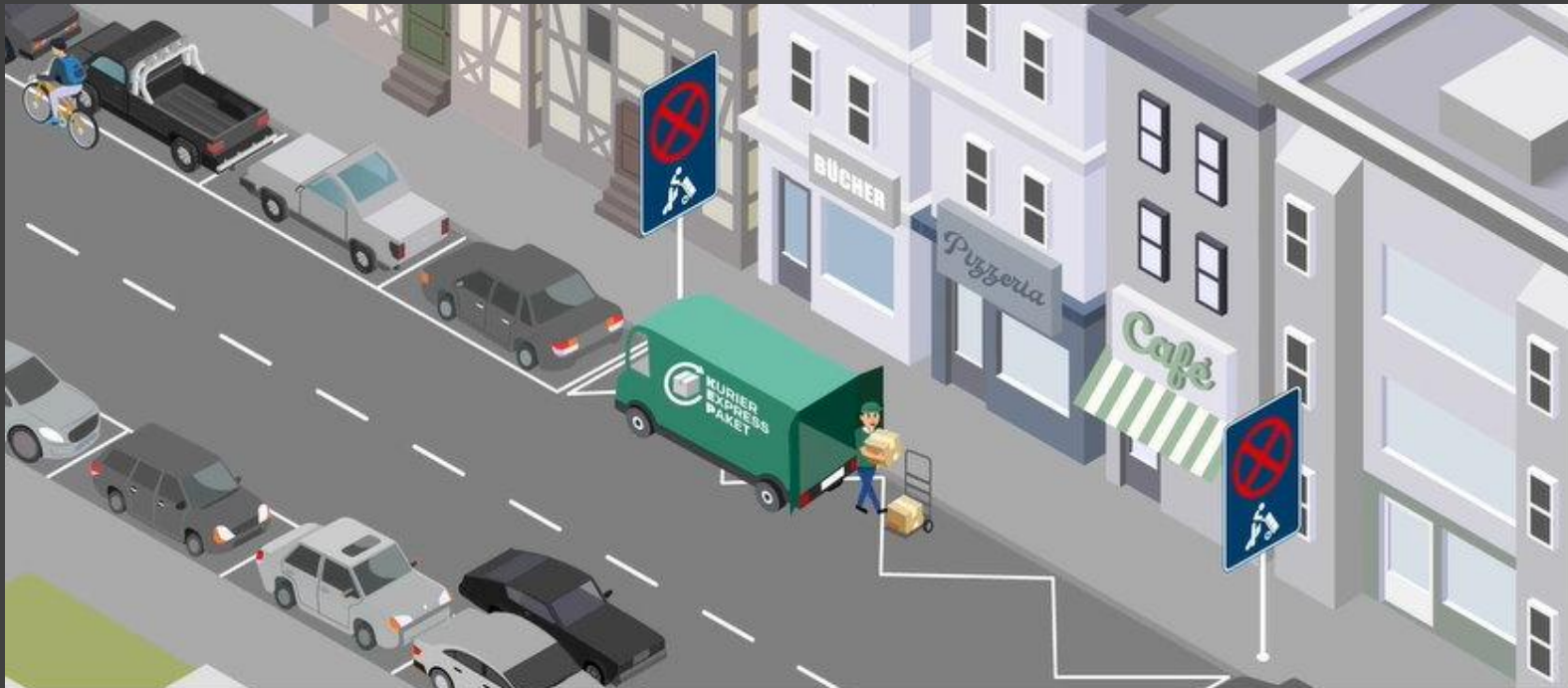
So stellt sich der BIEK eine Ladezone für Paketzusteller vor.

Innovative solutions for urban delivery (e.g. delivery areas; micro-hubs)