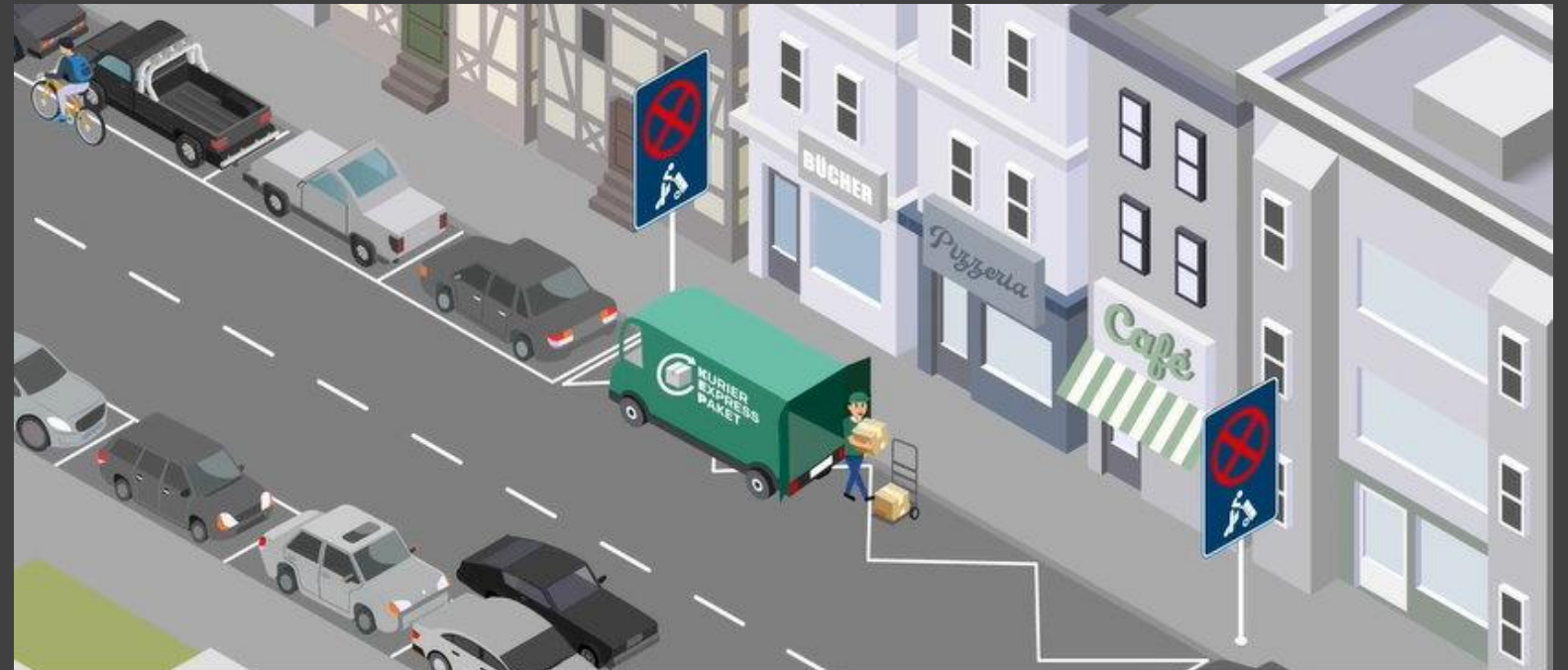
So stellt sich der BIEK eine Ladezone für Paketzusteller vor.