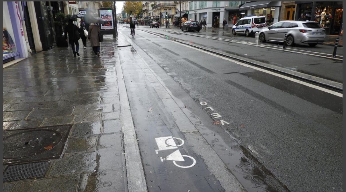
Cargobike delivery zones in Paris