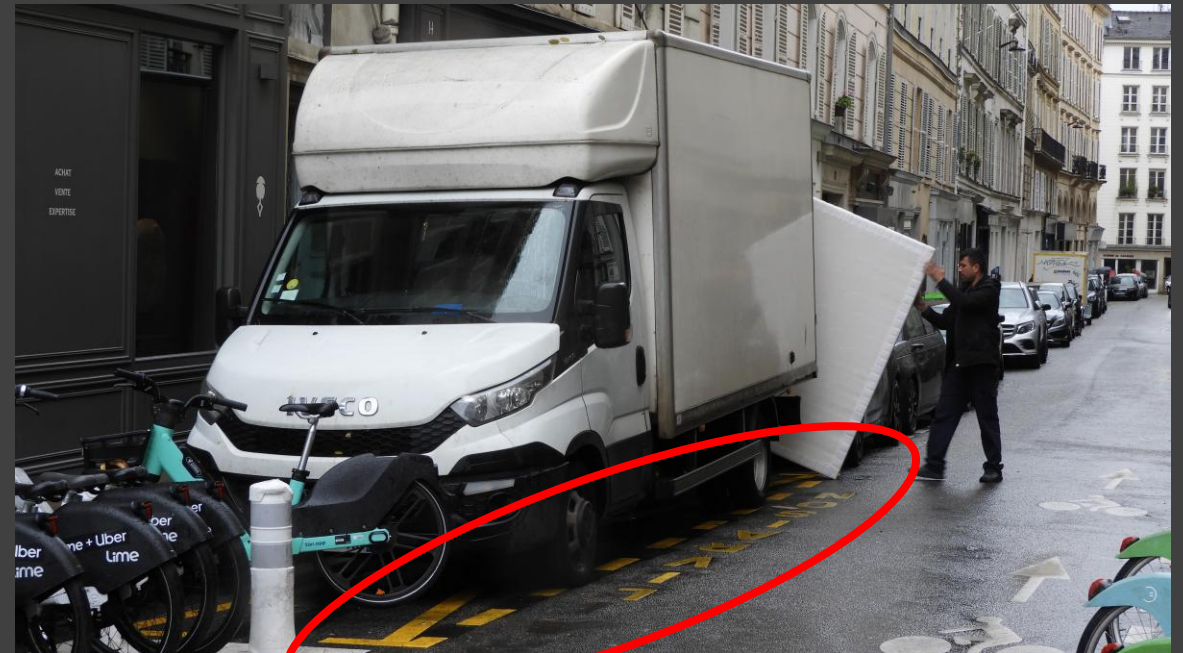
Delivery zones in Paris