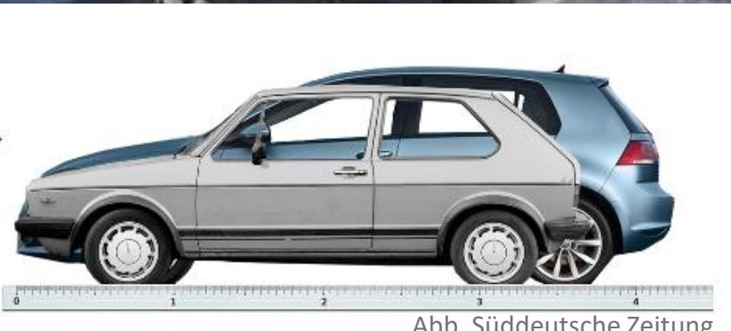
Abb. Süddeutsche Zeitung