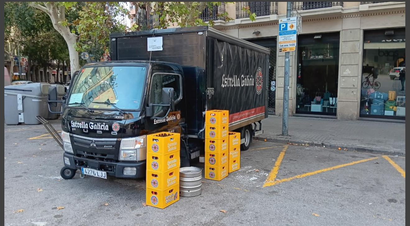
Delivery zones in Barcelona