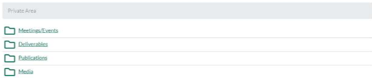
Figure 4. Private Area of the PLANET website

The Private Area features an online directory with selected documents available for download and for exchange. This comprises documents from