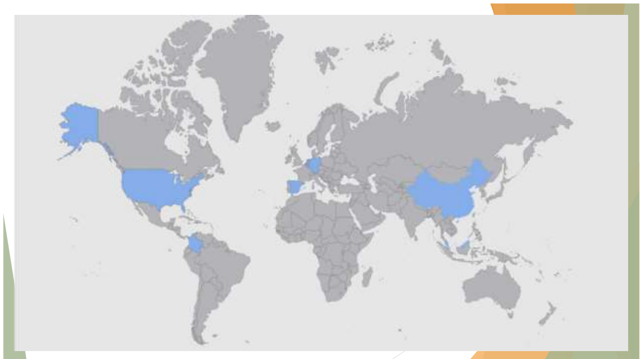
Figure 2. Geographic locations of PLANET Advisory Board members

Members of the Advisory Board are located across the globe (Figure 2) with different backgrounds in transport and logistics.