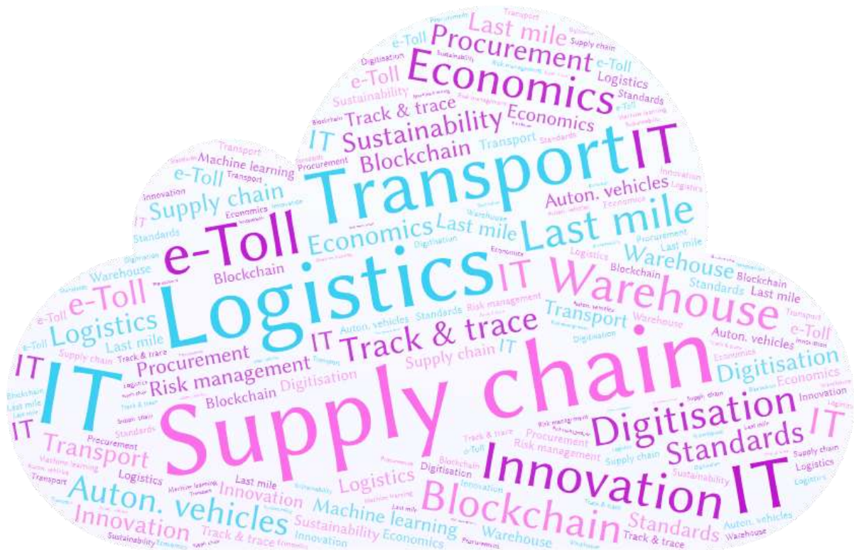
Figure 3. Word cloud of Advisory Board members’ background expertise

The key background knowledge of the Advisory Board members lies with supply chains, transport and logistics, but also with innovation, IT, and warehouses. This is not surprising since the selection of members was meant to cover these areas of PLANET. In the following, the background knowledge will be mapped against the Work package structure of PLANET to identify the areas where Advisory Board members can assist most.