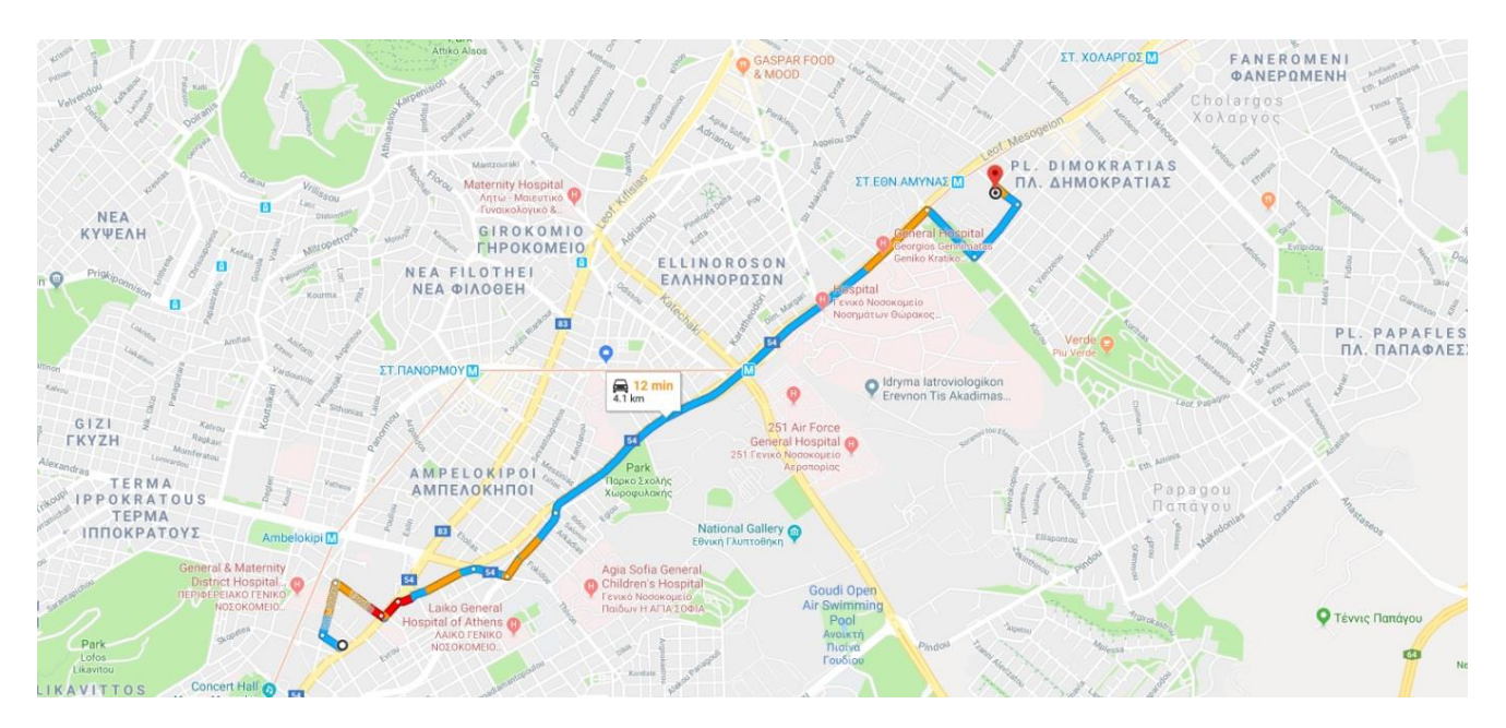
Map 1, To the ministry from the hotel.

Find out all the possible ways to move from ATHINAIS hotel to the Meeting Venue in the following link: \underline{ \text{https://goo.gl/maps/WUkkQJxRzVq} } \ .